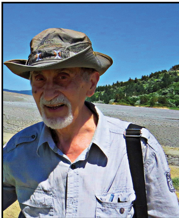
Berca, Vulcanii Noroiosi, Summer of 2019.