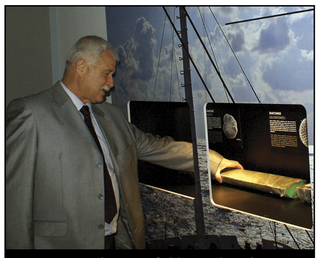
In May 2012, at the opening of exhibition "Dobrogea between land and sea, the imprint of time and man", at the Grigore Antipa Museum of Natural History, Bucharest.