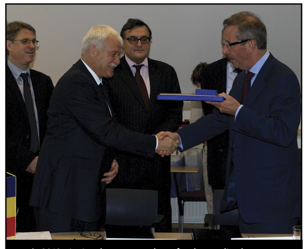
In 2013, signing the memorandum of understanding between GeoEcoMar and IFREMER, France.