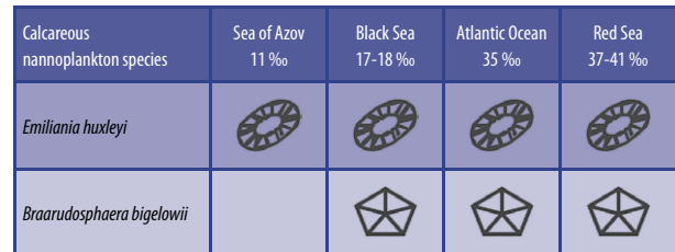
Fig. 2. Present-day distribution of the calcareous nannofloral taxa Emiliana huxleyi and Braarudosphaera bigelowii in various marine settings (after Melinte-Dobrinescu and Briceag, 2011; data from Bukry, 1974 and Giunta et al. , 2007).

the Red Sea, up to 41‰ (Fig. 2). Braarudosphaera bigelowii is also present at the very high salinity of the Red Sea, but not in the Sea of Azov; the minimum salinity where it could be found is around 17‰, in the Black Sea (Bukry, 1974; Giunta et al. , 2007).