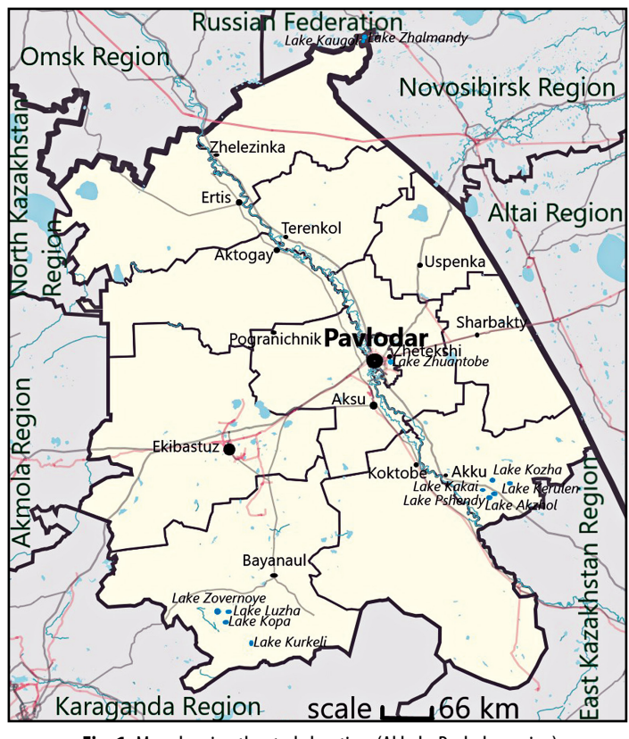
Fig. 1. Map showing the study location (Akkuly, Pavlodar region)

Fishes were caught from June to August within the 2013 to 2019 period in the North-Eastern part of the Republic of Kazakhstan within the Pavlodar region, namely in the Irtysh river, at various points along its course (in the territory of the Akkuly, Pavlodar regions) (Figure 1).